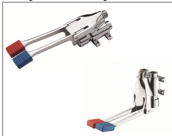
Immagine / Picture / Image

In accordo alla EN 9227 in merito all'aggressione salina According to EN 9227 regarding saline aggression Conformément à la norme EN9227 concernant l'agression saline