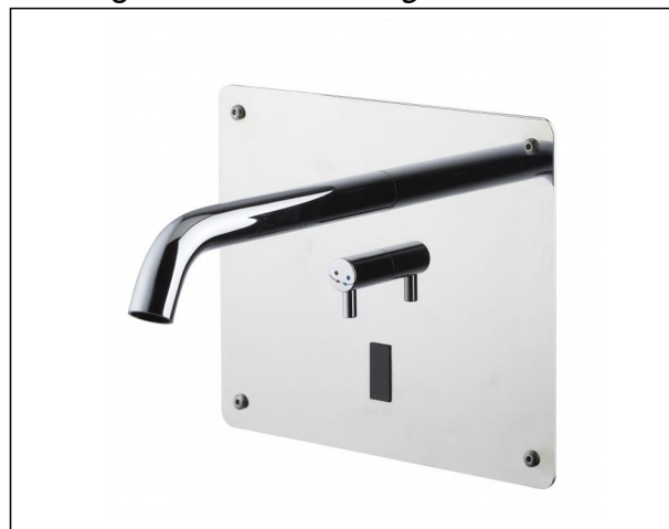
Immagine / Picture / Image