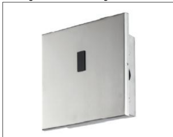
Immagine / Picture / Image

Rilevamento presenza Presence detection Détection de présence 7 sec