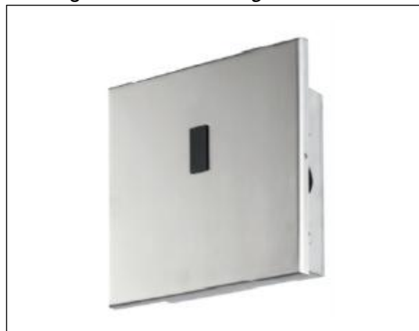
Immagine / Picture / Image

Rilevamento presenza Presence detection Détection de présence 7 sec