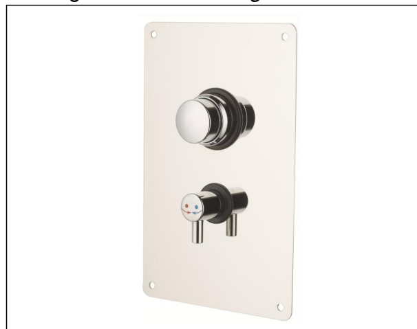
Immagine / Picture / Image

In accordo alla EN 9227 in merito all'aggressione salina According to EN 9227 regarding saline aggression Conformément à la norme EN9227 concernant l'agression saline